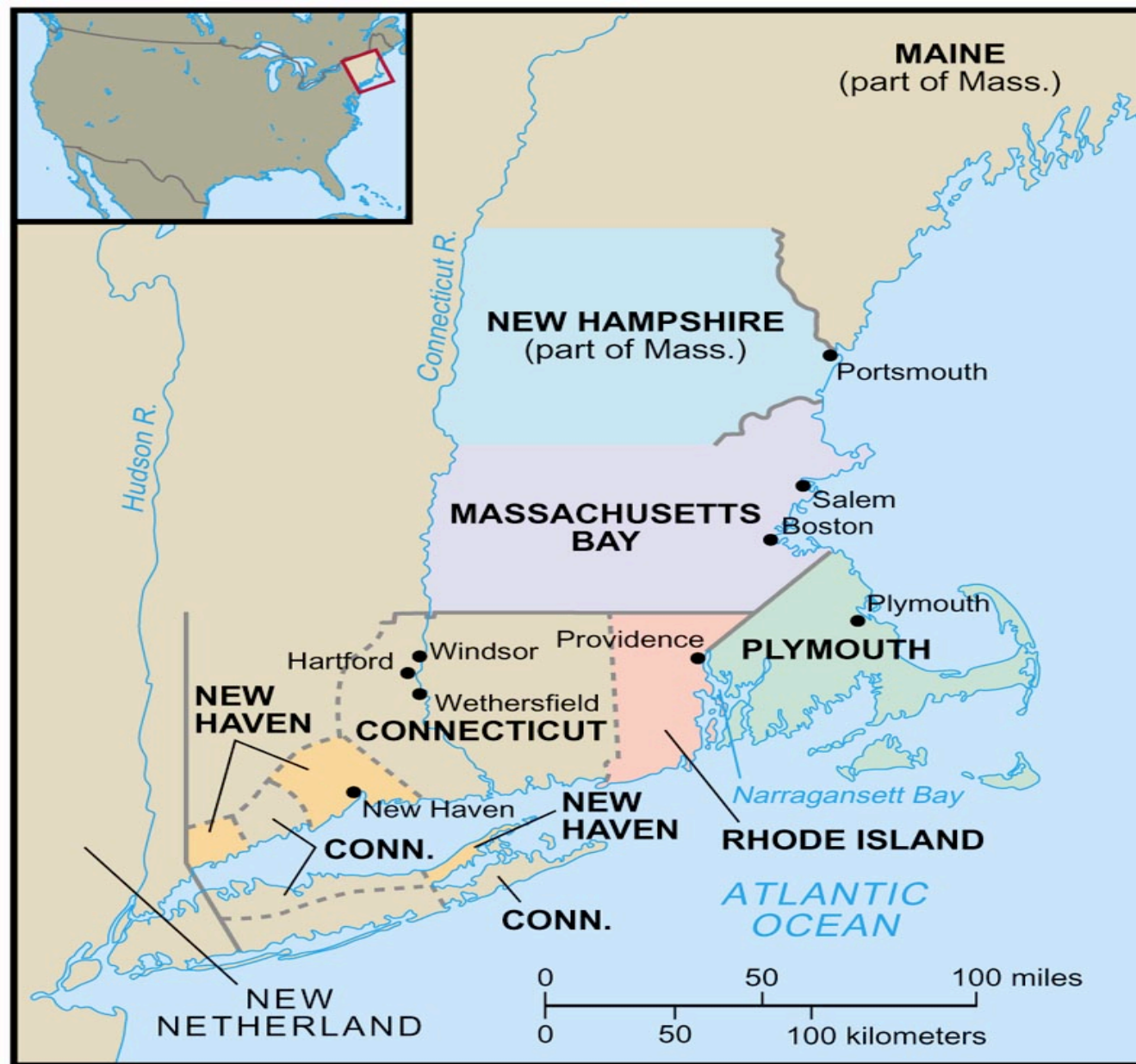
NEW ENGLAND COLONIES, 1650